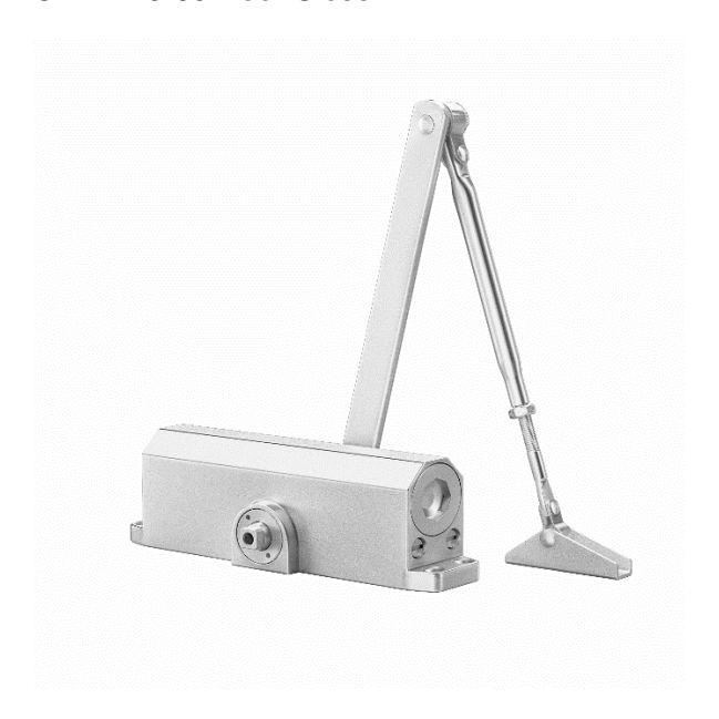
OEP-K13-85 Door Closer